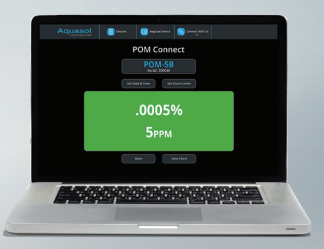
GREEN indicates that the current measurement is lower than the "Lower Alarm Limit."