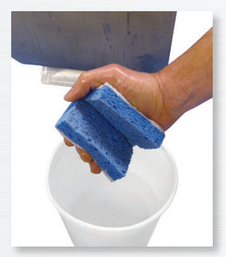
Moisten an ordinary sponge in water. Squeeze out excess water.