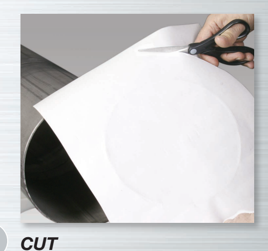
Cut the circle 1.3 times greater than pipe diameter.

Trace pipe's inner diameter. Create an impression of the pipe. Fold to form 90° angle.